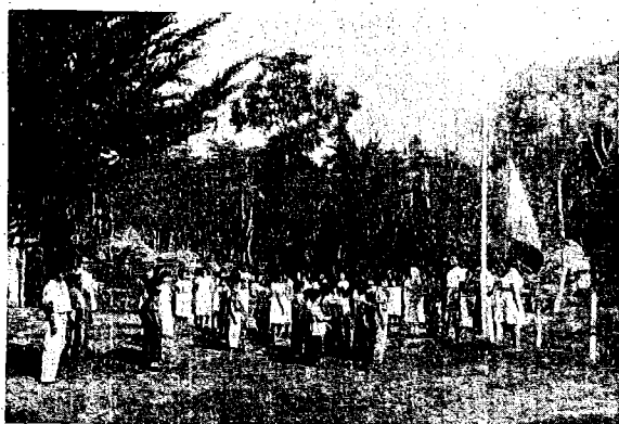
111 Children Salute the Flag

In Colombia many parents have confidence in a certain medicine that is said to "open the mind" of a child to permit him to learn more easily. Some are learning, however, that the Mission School with its loving and modern ways of teaching is even more effective....that even seemingly stupid children are becoming enlightened.